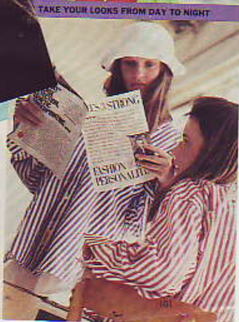
TAKE YOUR LOOKS FROM DAY TO NIGHT

Then watch as we make over three friends with all-new hair and makeup. Till next month.