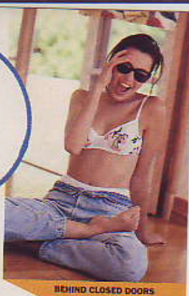
BEHIND CLOSED DOORS